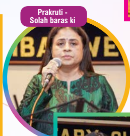
Prakruti - Solah bars ki