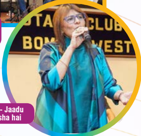
Trusha - Jaadu hai nasha hai