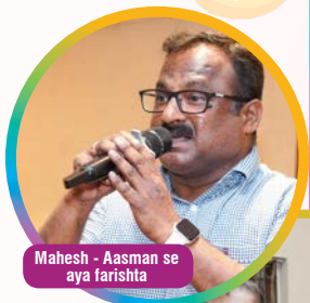
Mahesh - Aasman se aya farishta