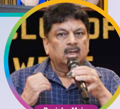
Panjak - Main jahan rahoon