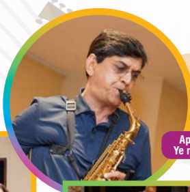
Apurva - Ye mera dil