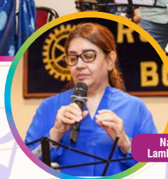
Nalini - Lambi judaai