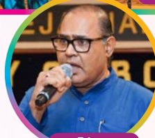
Tejas - Gulabi ankhen