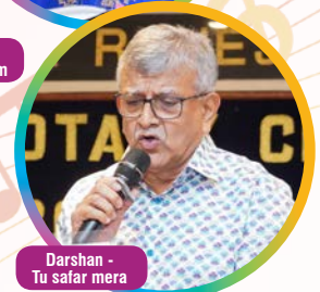
Darshan - Tu safar mera