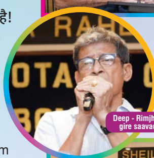
Deep - Rimjhim gire saavan